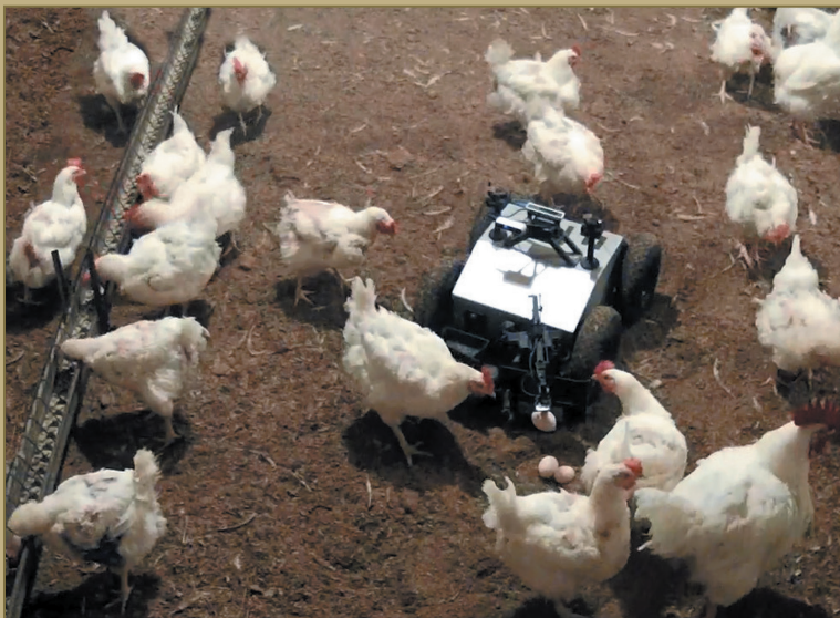
Field testing demonstrates GTRI's poultry house robot's capability to autonomously pick up floor eggs.

To this end, the robot has to be able to move autonomously through the flock, actively sensing the birds and reacting to them so as not to harm them. This work was completed in 2015 and was demonstrated with successful field tests in 2016 where the robot navigated among a flock in a commercial house. To date, the robot has operated fully autonomously in commercial houses and smaller scale test houses replicating commercial facilities for multiple hundreds of hours.